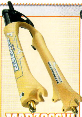
MARZOCCHI ALL MOUNTAIN 1