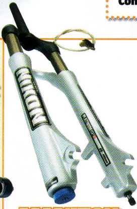
MANITOU NIXON PLATINUM