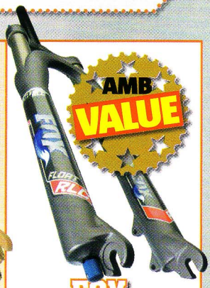
FOX FLOAT RLC